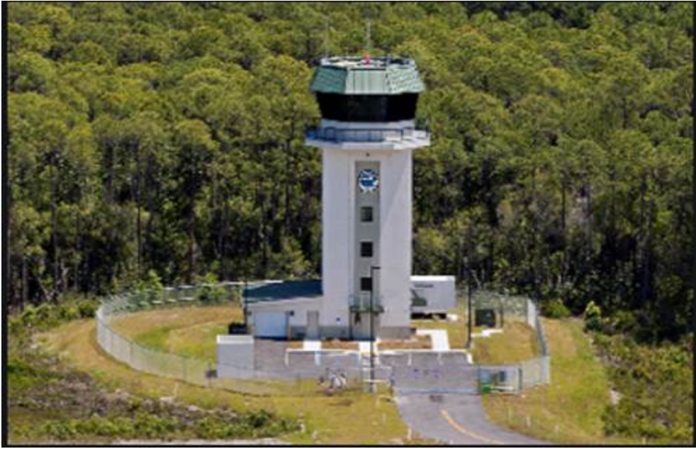
(Photo of the Air Traffic Control Tower at DTS is located at the Destin Executive Airport)

Below is a photo of the County building at CEW is located at Bob Sikes Airport. The request within the bid package is a portion of the building that is circled. Square footage previously provided.